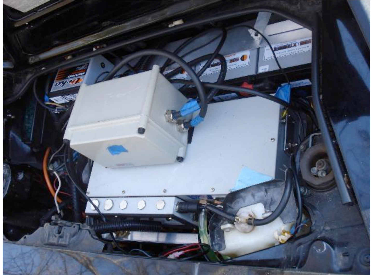
Blue tags are labels I haven't removed yet as the instrumentation box still needs to be installed